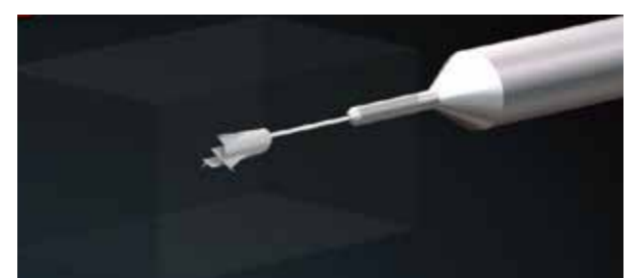
樹脂成形(射出成形) Injection molding