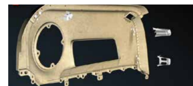
部品取り付け(接着) Welding parts