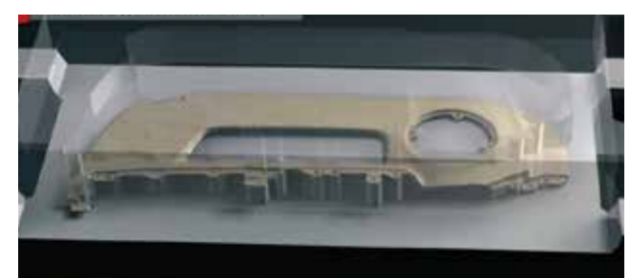
基材成形(プレス成形) Pressing base material