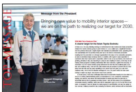
Message from the President