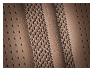
(Closeup Seat Embroidery)