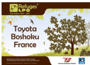
LPO sanctuary certificate