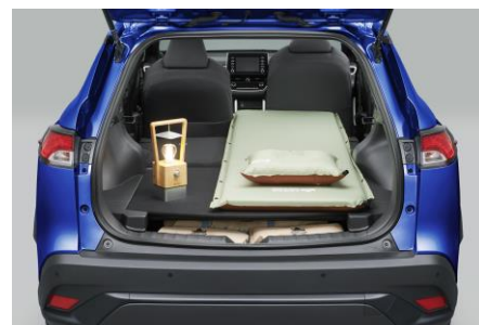
Space for an adult to lie flat with rear seats folded down

This product is set to be released as an optional interior part in December 2021. (Only in Japan) Other featured interiors include the door trims and floor carpets.