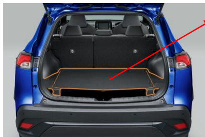
luggage active box

* a Toyota genuine part (dealer installed option)