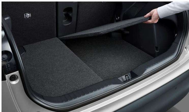
The 60/40 Split adjustable deck board

Toyota Boshoku has developed a deck board divided left and right in a 60/40 split, in which the luggage area floor height can be adjusted to two levels to accommodate stowed luggage of different heights. The system offers a wealth of layout options when combined with the 40/20/40 split rear seat. This new technology helps to improve the convenience and usability of the compact SUV luggage space.