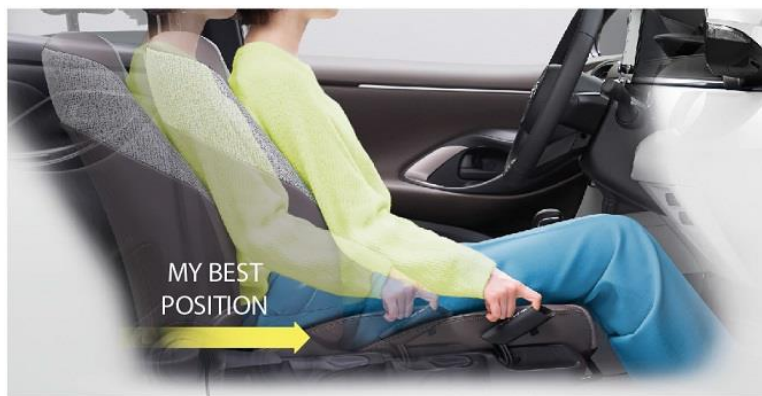
Driver's Easy Return Seat function

(Installed in the grade HYBRID Z, Z, and option in HYBRID G, G)