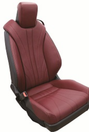
Genuine leather seats

*1: installed in LC500h, LC500h“S Package”,LC500 and LC500“S Package”