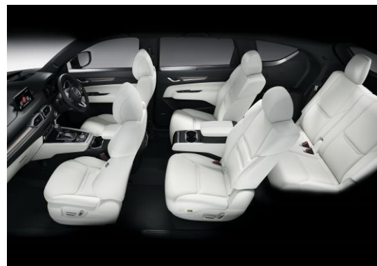
MAZDA CX-8 XD Exclusive Mode (Special Edition) Photograph used with the permission of Mazda Motor Corporation; reproduction or reuse for any other purpose is prohibited.